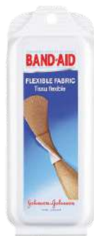
Band-Aids Pkg. of 12