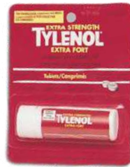
Extra Strength Tylenol Tablets Pkg of 12