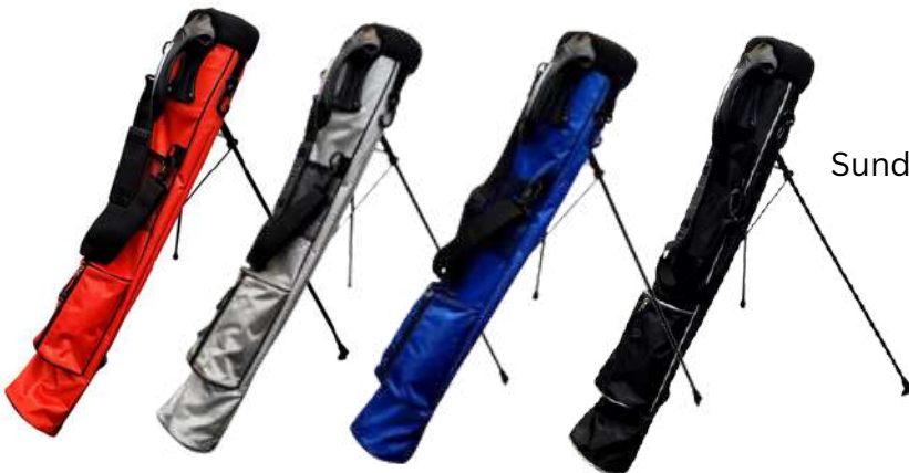
Sunday Bags With Stand, handle, and Strap Colors: Black, Silver, Blue and Red

FS1541 - First Grade FS1542 - Second Grade