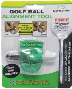
Golf Ball Alignment Tool