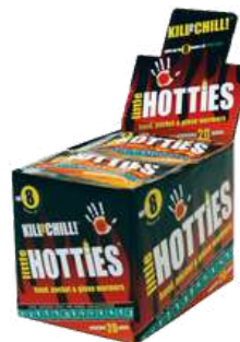
Little Hotties Warming Packs