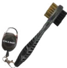
Dual Cleat and Club Brush with clip