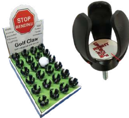
Upright Golf Claw