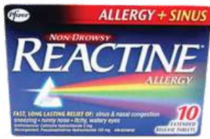
Reactine Tablets Pkg of 10