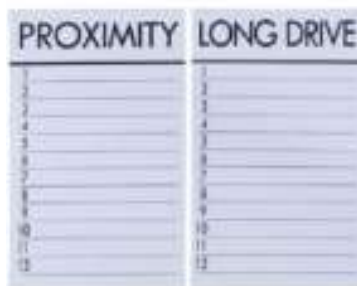
Proximity/Long Drive Marker Cards