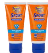
Banana Boat Sunscreen 30 ml