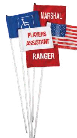
Cart ID Flags

Ranger GST09800 Player Assistant GST09801 Handicap ID GST09802 Marshal GST09803