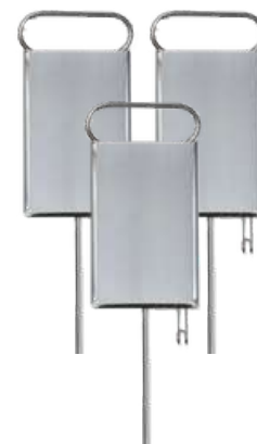
Contest Drive Marker Steel