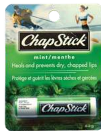
Chap Stick Pkg of 12