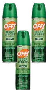
Deep Woods Off Bug Repellant 30 ML Pump