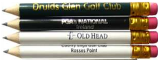
Plate fee: $50/logo (initial order only) $100 Logo set up charge for plastic items with order less than 20,000 pieces

Imprinted wooden golf pencil with eraser (1 color 1 position printing) 144pcs/box,40boxes/CTN