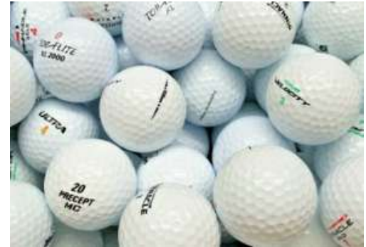
Used Golf Balls

FS1541 - First Grade FS1542 - Second Grade