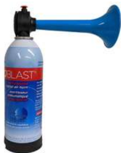
EcoBlast Air Horn