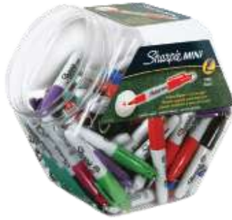
Sharpie Minis Bowl Of 72